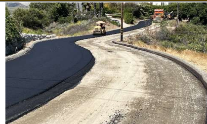
Paving on cement treated base on Edgemont Dr.

There is a variety of work currently being done throughout the City associated with this project. Residents should expect minor delays. Drivers should adhere to posted signs and use proper precautions. If restricted parking is necessary, "No Parking" signs will be posted 48 hours in advance of construction activities.